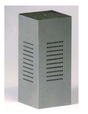
Figure 1. Microchannel block

Microchannel technology offers new possibilities for FTS allowing highly compact units (process intensification), intrinsically safe functioning and excellent temperature control with substantial significance in control selectivity for liquid fuels (C5+ selectivity).