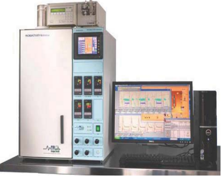
PID-Micromeritics Microactivity Reference

The objective of this communication is to present developments in adapting a catalytic test unit (PID-Micromeritics Microactivity Reference) for